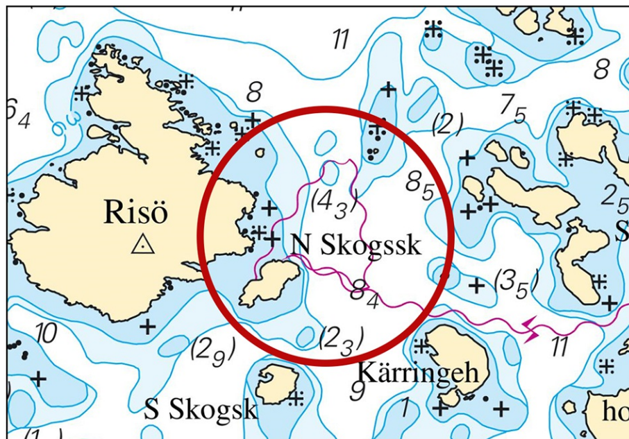
Operational area for diving work

Bsp Västkusten S 2021/s19, s20, Bsp Västkusten S 2023/s19, s20